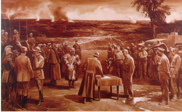
Mark Tansey, "Triumph of the New York School" (1984).