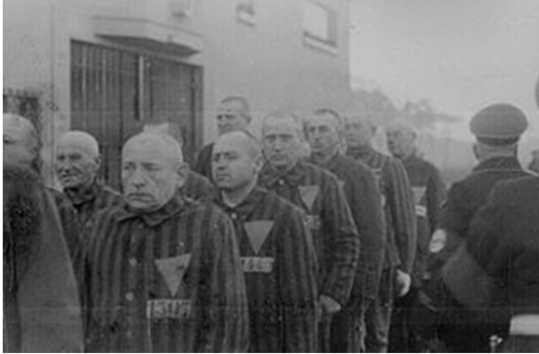
Prisoners of Sachsenhausen, 19 December 1938